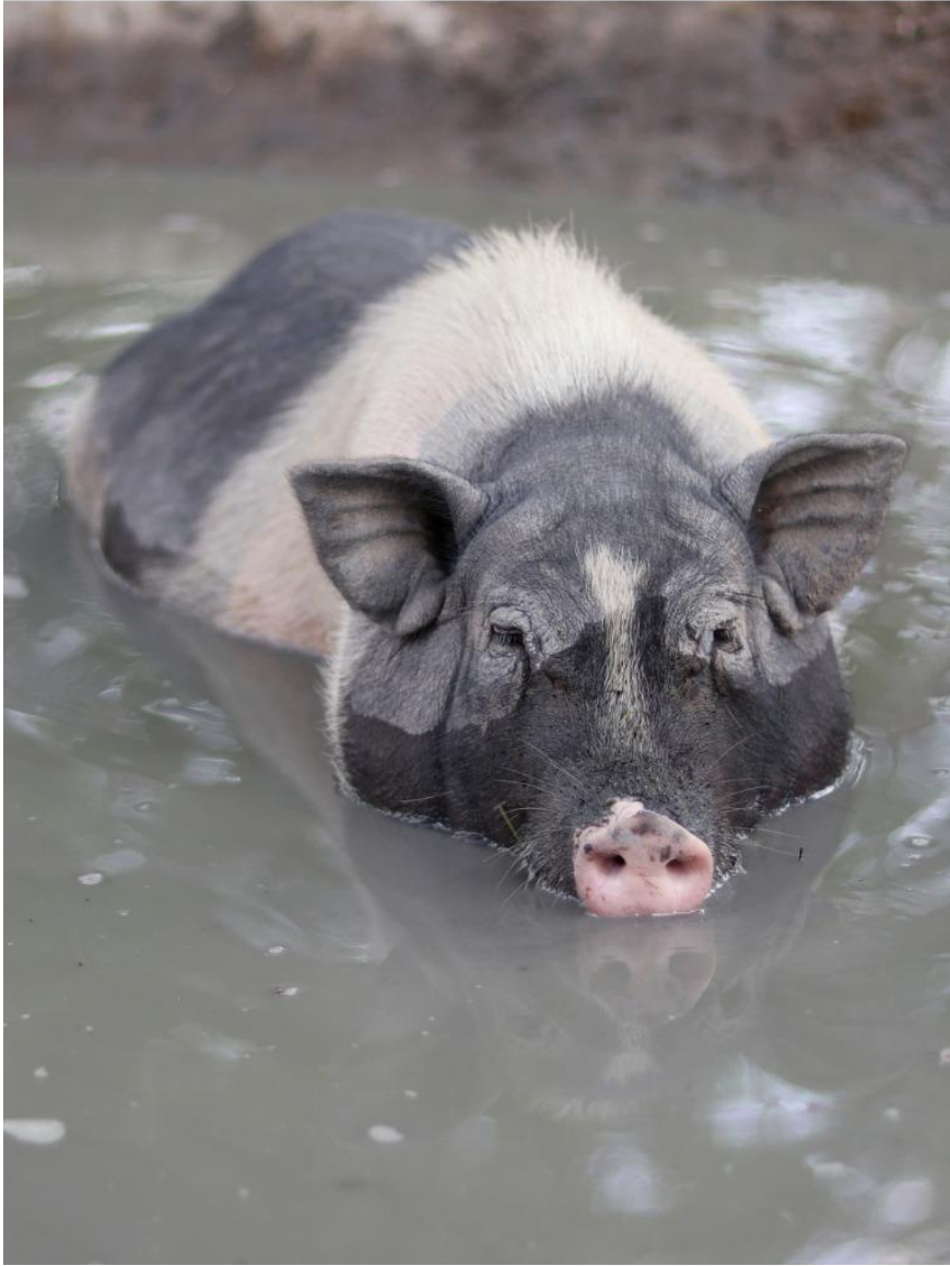
Pigs get wet.