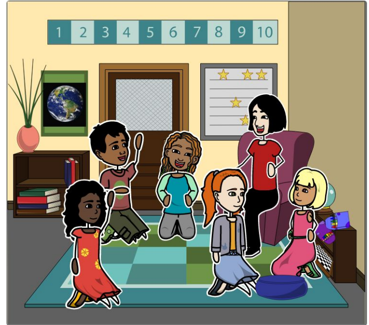
Max zips to the rug.